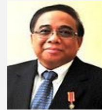
Dr. Ir. Dwisuryo Indroyono SOESILO, M.Sc* Coordinating Minister for Maritime Affairs, Indonesia