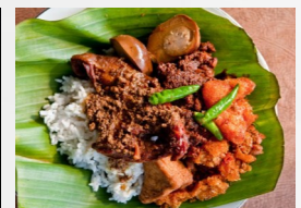
Gudeg: Traditional food