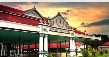
The Kraton: Palace Fit For A Javanese King