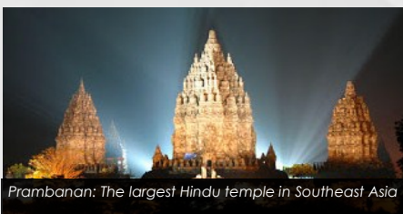
Prambanan: The largest Hindu temple in Southeast Asia

Yogyakarta (or Jogjakarta) has been known as The Never Ending Asia . Many say that a single visit to Jogja is never enough. The list of things you can experience in Jogja may seem overwhelming, ranging from natural splendors, art, tradition and heritages to culinary adventure. This is why Jogja is the second most visited destination in Indonesia, after Bali.