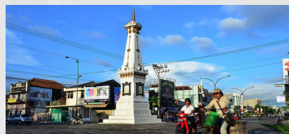
Tugu Jogja: Landmark of Jogja City