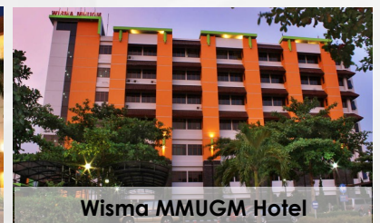
Wisma MMUGM Hotel

Rate starts from = $43 (Distance: 5 min)