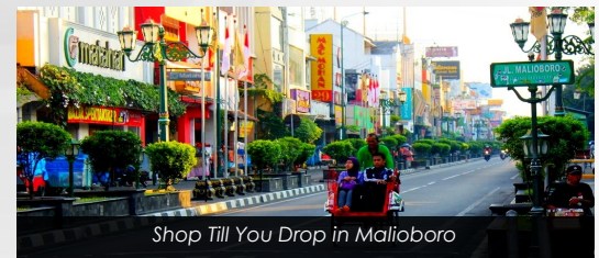
Shop Till You Drop in Malioboro