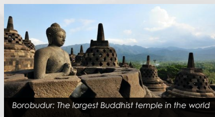
Borobudur: The largest Buddhist temple in the world