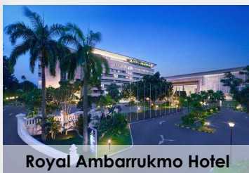
Royal Ambarrukmo Hotel