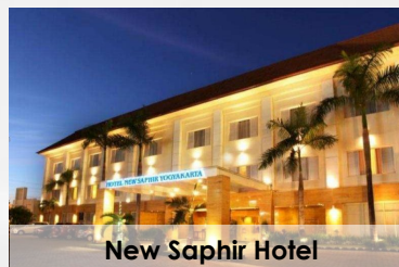
New Saphir Hotel

Rate starts from = $94 (Distance: 3 min)